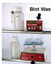
Belly Dancer (has to be ordered separately)