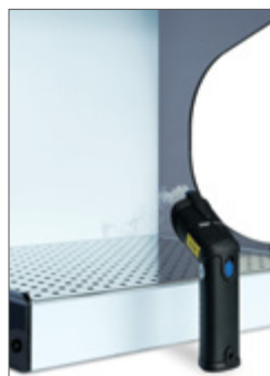
Flow demonstrated with a Dräger Flow Check.