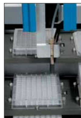
Single Channel Dispenser