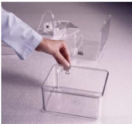
The dispensing/aspирating tube bits are designed to work with containers already in use in your lab. A stainless steel clip attaches the dispensing/aspирating bits to the side of the container. A nylon thumbscrew loosens to allow adjustment of the bits up or down to work with different container depths.

Without automation, what should take 20 to 30 minutes for a set of repeated rinses can extend to hours because one generally attempts to do other things while being interrupted by these washes. Why spend your time doing what a monkey can do? Wouldn't you rather press the "start" button and have 30 uninterrupted minutes to read a paper or set up another experiment?